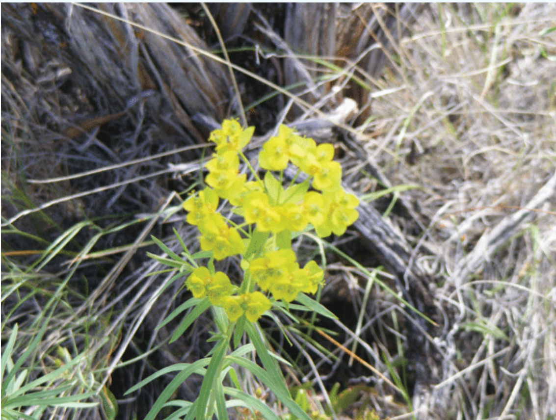
Leafy spurge in the Greater Yellowstone area. It is considered a serious threat to Yellowstone National Park.

The Project follows an integrated pest management approach using appropriate biological, cultural, and herbicide practices with extensive releases of biocontrol insects to achieve Project objectives. In 2009 and 2010, the Project released nearly ten million insects treating approximately 9,000 acres of leafy spurge infested lands, inventoried over 20,000 acres for new infestations, and established numerous insectaries for raising and releasing biocontrol insects. The Holding the Line Project has been funded by the project participants and grants from the U.S. Forest Service State & Private Forestry – Ogden, UT, Caribou-Targhee National Forest, and the Greater Yellowstone Coordinating Committee.