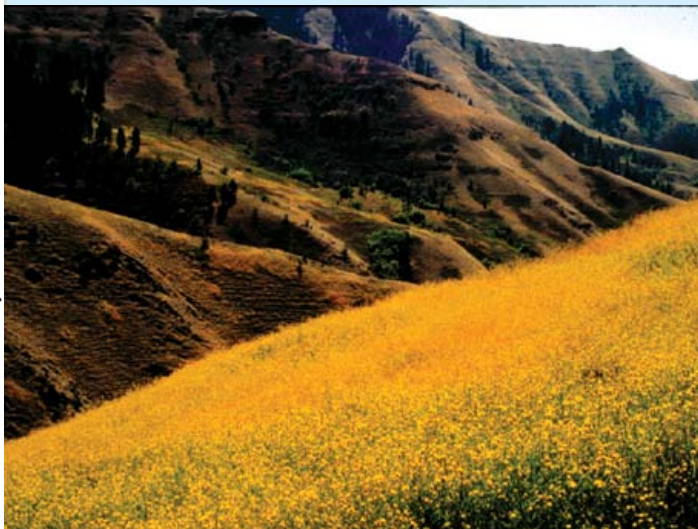
Yellow starthistle infestation in Hells Canyon, Nez Perce County