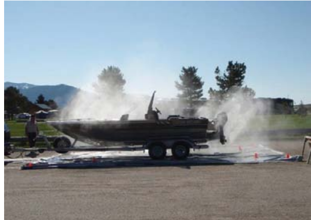
Boat decontamination at Henrys Lake, Idaho.