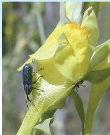
Dalmatian toadflax biological control agent ( Mecinus janthinus ) Toadflax stem weevil