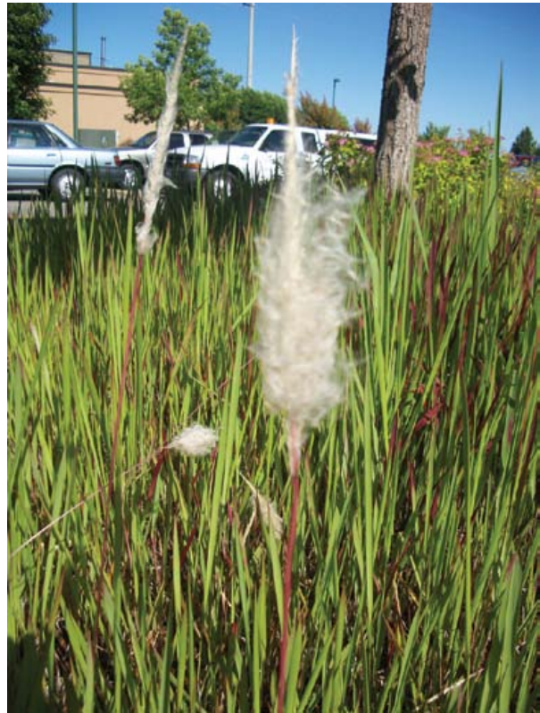
Cogongrass is a federal noxious weed that is still widely used in landscaping.

It takes years of diligent efforts to eliminate harmful non-native species. Additionally, invasive species management including detection, control, eradication, monitoring, and rehabilitation strategies is expensive. Control and eradication costs are rarely a one-time expense. Management costs alone sometimes exceed the total budgets of managing agencies. Hence, affected land can and does go untreated or inadequately restored. In some cases, the cost of managing infested public lands may be passed on to the public through higher fees and taxes.