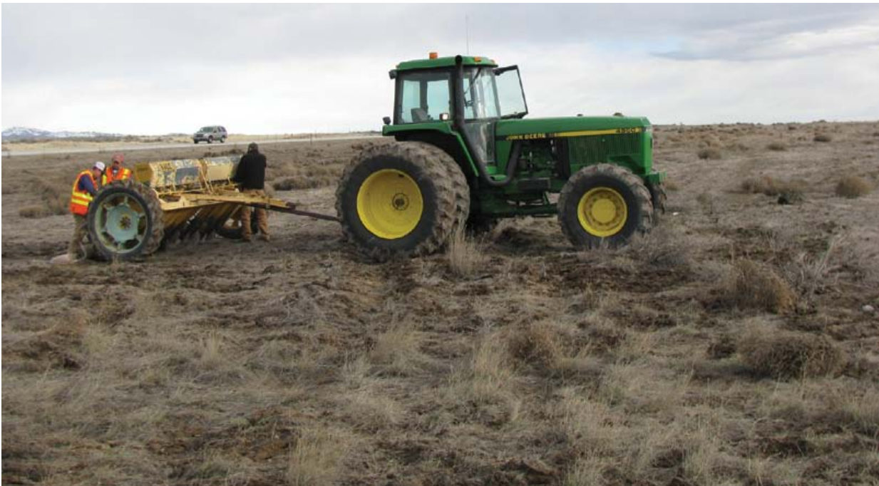
Rehabilitation of weedy areas along interstate right-of-way.