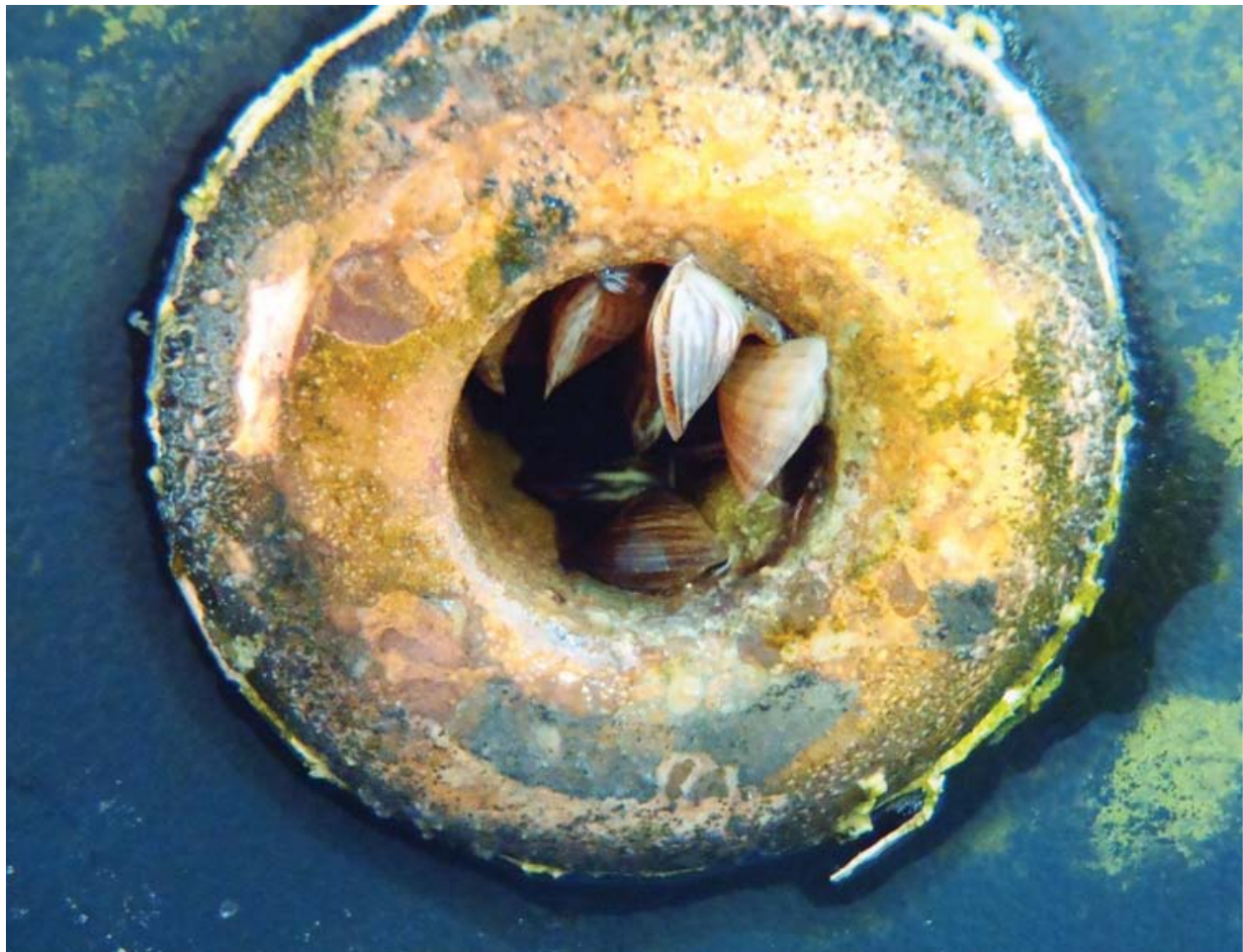
Quagga mussels can be introduced to Idaho on the insides of boats from infested waters such as Lake Mead.