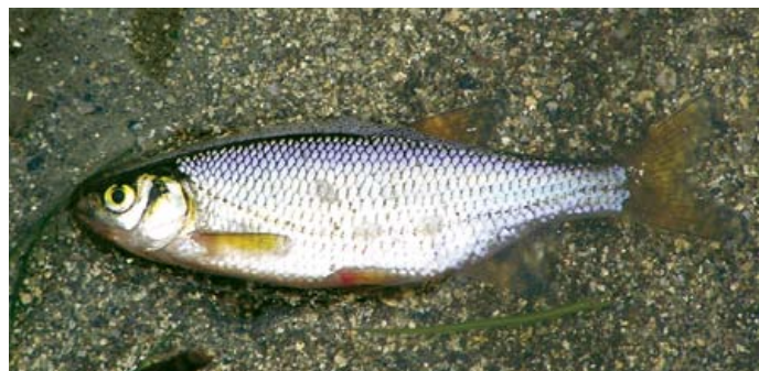
Golden shiner - invasive species.

To date, the cost to Idaho anglers has been in excess of $100,000 to control golden shiners in Deer Creek Reservoir.