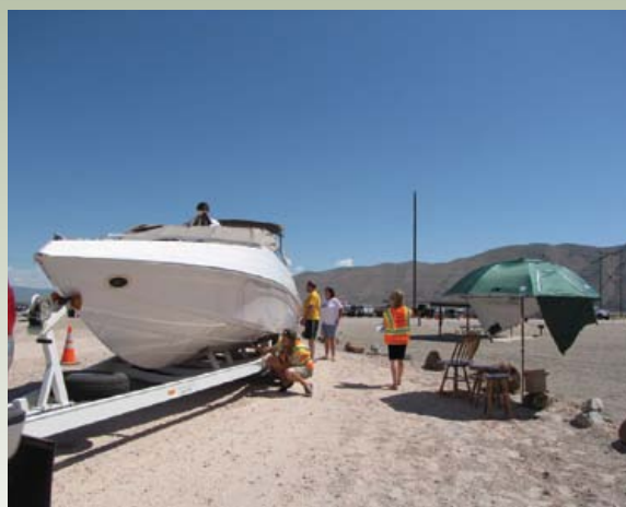
Inspection stations are open throughout the boating season.

The State of Idaho has conducted more than 100,000 watercraft inspections since July 4th, 2009. A total of 35 fouled boats have been intercepted and decontaminated before they were allowed to launch into Idaho's waters.