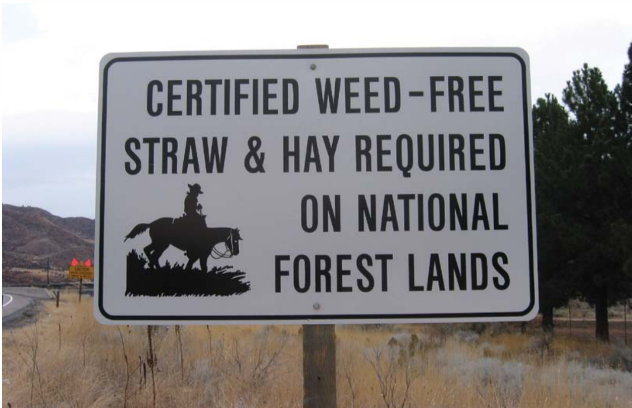
Idaho's noxious weed-free hay certification program aims to limit the spread of weeds in forage and straw.

To help growers meet these requirements, the ISDA has promulgated the NWFF&S Certification Rules http://adm.idaho.gov/adminrules/rules/idapa02/0631.pdf . Idaho's program is managed by ISDA and each county. For a field to be certified noxious weed free, it must be inspected by an ISDA certified inspector prior to, but no sooner than, ten days BEFORE harvest. There is a fee for the inspection.