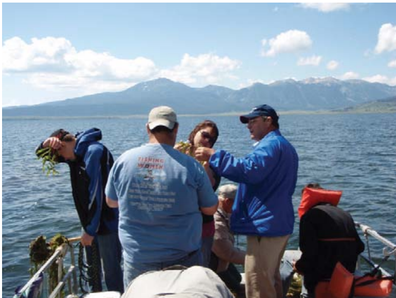
Training to properly identify species is key to prevention.

The state needs reliable information on emerging threats and new species arriving here. Without it, intervention is not likely to be timely or successful. Early detection of new