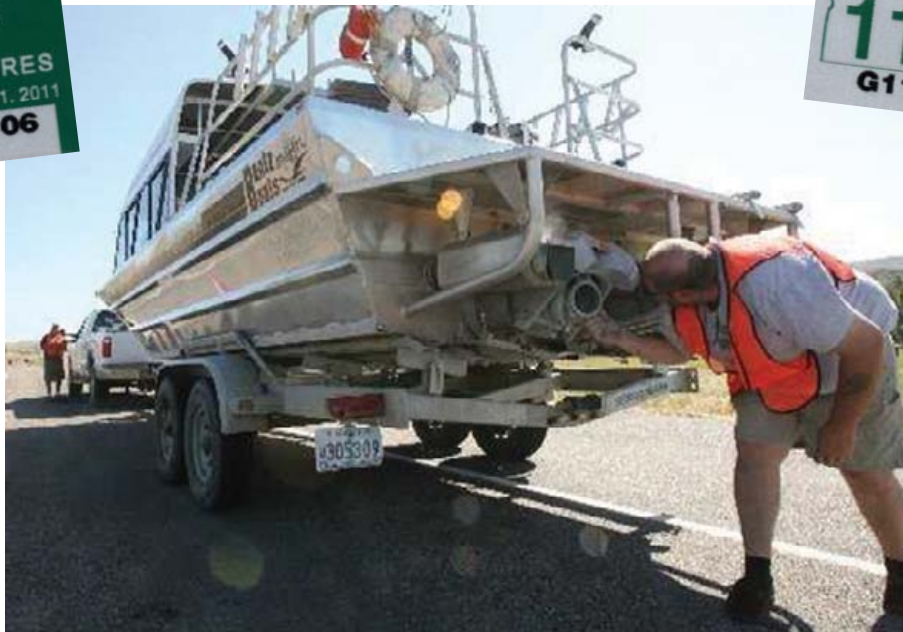
The Idaho Invasive Species Prevention Sticker revenue funds watercraft inspection stations statewide.