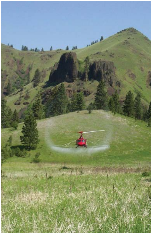
Aerial spraying for noxious weeds on Craig Mountain, Nez Perce County.