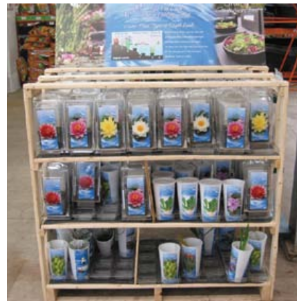
Potential pathways include the pet trade, moving firewood, water gardening, and unintentional movement of aquatic weeds on boats and trailers.