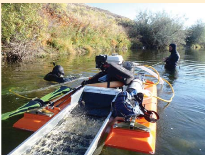
Crews work to remove hydrilla in the Bruneau River.

Maine, and Wisconsin. The lower temperature limit of the dioecious biotype is not well established in scientific literature, but its distribution appears to be limited in the U.S. by cold temperatures. The distribution of dense hydrilla in the Bruneau system appears to be limited to the geothermal waters that are found throughout the seven miles of the river system below Hot Creek. Hydrilla found outside of the warm water influenced area is believed to have been deposited as tubers that were moved downstream during high spring flows.