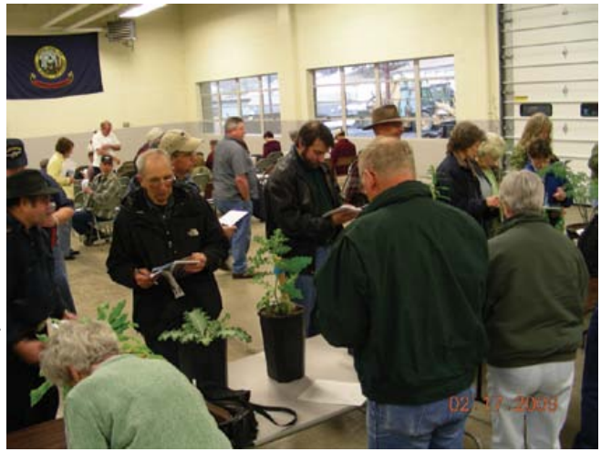
Weed identification training are an important activity organized by CWMA's.